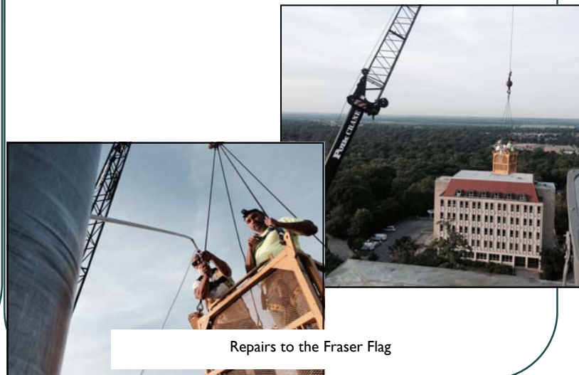
Repairs to the Fraser Flag