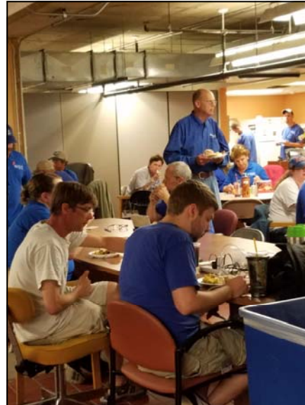
Zone 2 (above) gathers to have a pot luck meal in Spring of 2016.