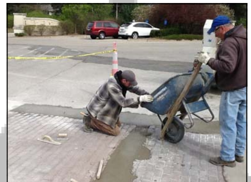
KUC repairs the drive at the Visitor's Center.